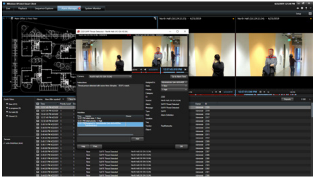
Milestone XProtect alarm activated by SAFR face recognition